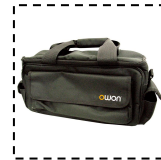
Soft Bag (optional)